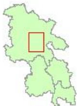
Catchment area for Aylesbury Vale Academy from September 2020

This map is reproduced from Ordnance Survey material with the permission of Ordnance Survey on behalf of the controller of Her Majesty's Stationary Office. Crown Copyright. Unauthorised reproduction infringes Crown Copyright and may lead to prosecution or civil proceedings. © Copyright Buckinghamshire County Council Licence No. 10001209 2019