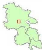
Catchment Area for Aylesbury Vale Academy Primary from September 2021

This map is reproduced from Ordnance Survey material with the permission of Ordnance Survey on behalf of the Controller of Her Majesty's Stationary Office. Crown Copyright. Unauthorised reproduction is prohibited. Crown Copyright and may lead to prosecution or civil proceedings. © Copyright Buckinghamshire County Council Licence No. 10001929 2020