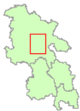
Catchment area for Aylesbury Vale Academy from September 2020

This map is reproduced from Ordnance Survey material with the permission of Ordnance Survey on behalf of the controller of Her Majesty's Stationery Office. Crown Copyright. Unauthorised reproduction infringes Crown Copyright and may lead to prosecution or civil proceedings. © Copyright Buckinghamshire County Council Licence No. 100021026 2019